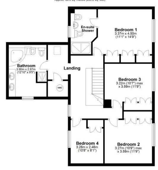
Total area: approx. 213.0 sq. metres (2292.5 sq. feet)

Marlborough | 01672 552777 | marlborough@winkworth.co.uk