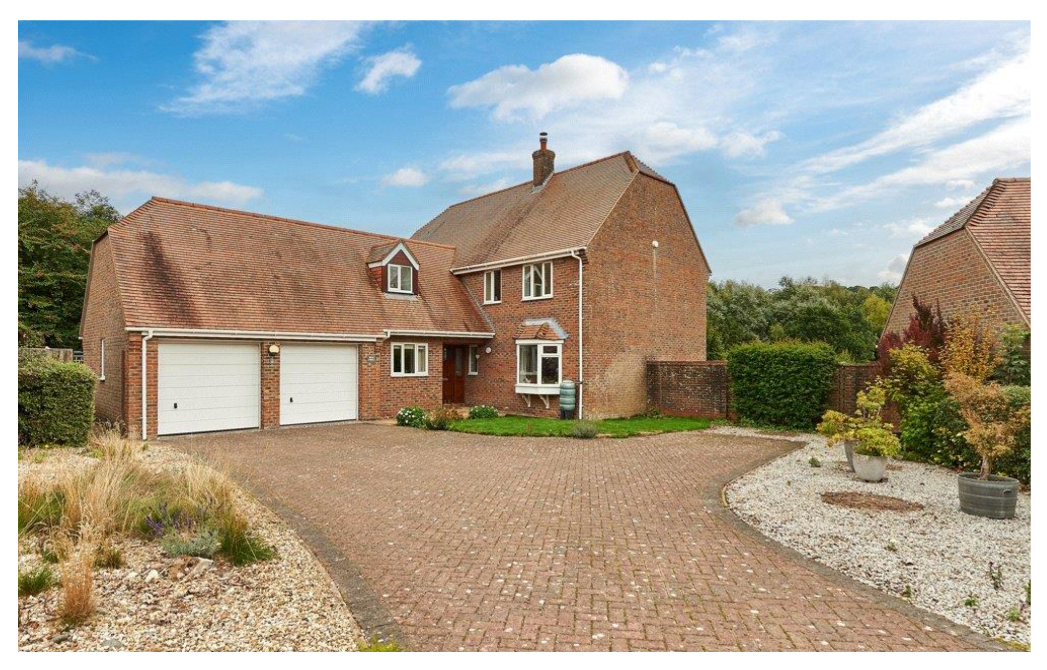
Backing Directly onto Open Fields