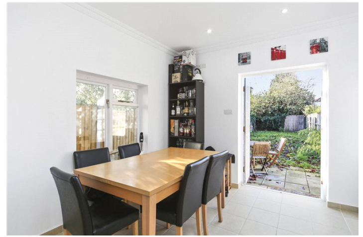
SEDGEFORD ROAD, W12