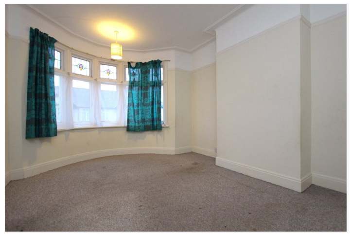
OAKHURST ROAD, SOUTHEND ON SEA £325,000 FREEHOLD