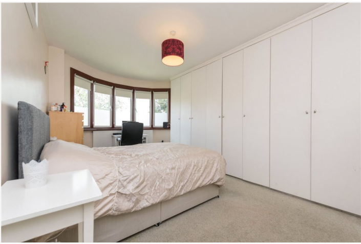
BRYAN AVENUE, NW10 £346.15 PER WEEK FURNISHED