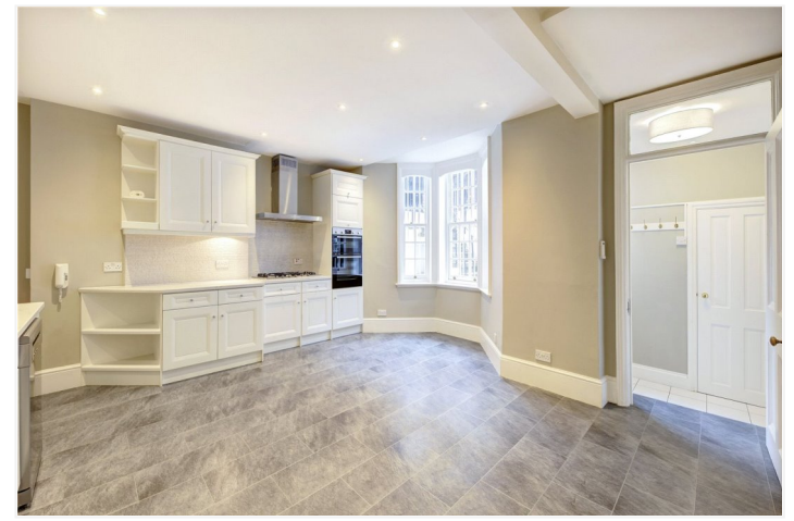
HORNTON STREET, W8 £4,750,000 FREEHOLD

A LARGE AND BEAUTIFULLY PRESENTED GRADE II LISTED TERRACED HOUSE WHICH ENJOYS AN ELEVATED POSITION IN HORNTON STREET.