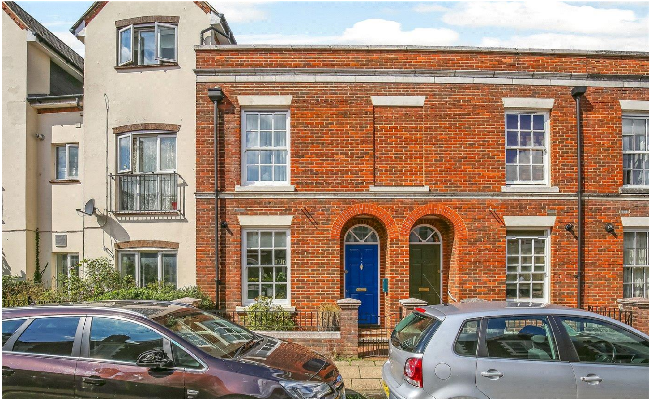
Milman Court, 25B Parchment Street, Winchester, SO23 8AZ