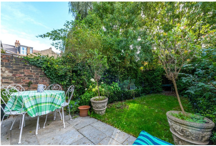
BRAMSTON ROAD, LONDON, NW10 £1,599,950 FREEHOLD

A TRULY STUNNING FIVE BEDROOM FAMILY HOME IN SUPERB CONDITION, WITH A LARGE PRIVATE GARDEN AND TWO ROOF TERRACES.