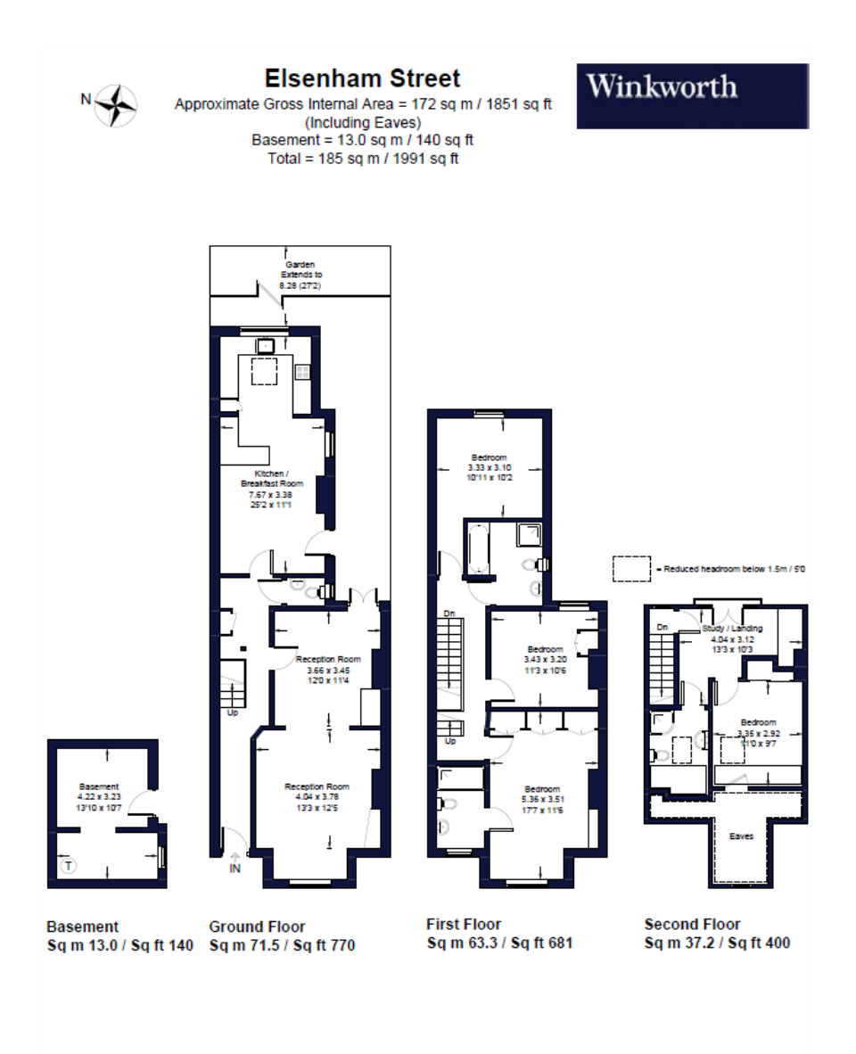
Illustration for identification purposes only, measurements are approximate, not to scale. FloorplansUsketch.com © 2020 (ID648135)