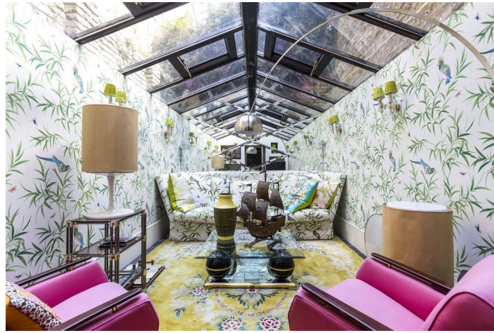
YARDLEY STREET, LONDON, WC1X £1,499,999 FREEHOLD

A UNIQUE AND OUTSTANDING GRADE II LISTED GEORGIAN TOWN HOUSE CLOSE TO EXMOUTH MARKET. THIS INTERIOR DESIGNED PROPERTY, SET OVER FOUR FLOORS, HAS BEEN METICULOUSLY AND TASTEFULLY REFURBISHED TO A HIGH STANDARD.