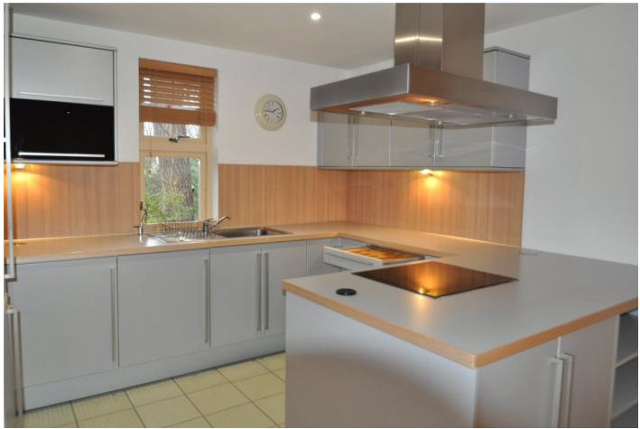
FLAT 10, NEW DOVER ROAD, CANTERBURY, CT1 £1,100 PER MONTH UNFURNISHED

Canterbury | 01227 456 645 | canterbury@winkworth.co.uk