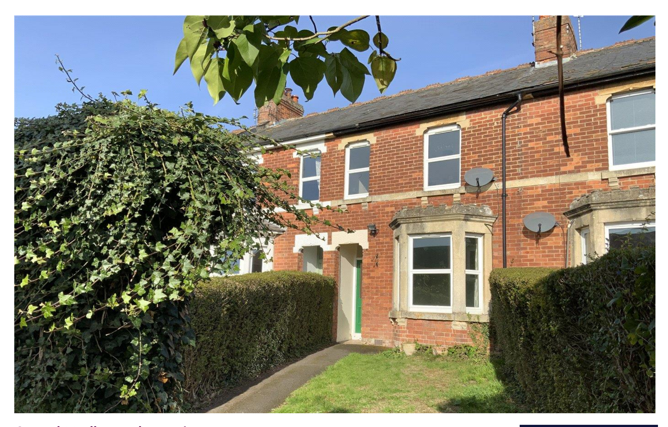
Central Marlborough Location