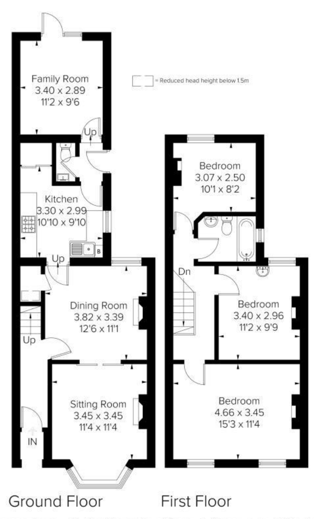
Surveyed and drawn in accordance with the International Property Measurement Standards (IPMS 2: Residential) fourwalls-group.com 246475

Marlborough | 01672 552777 | marlborough@winkworth.co.uk