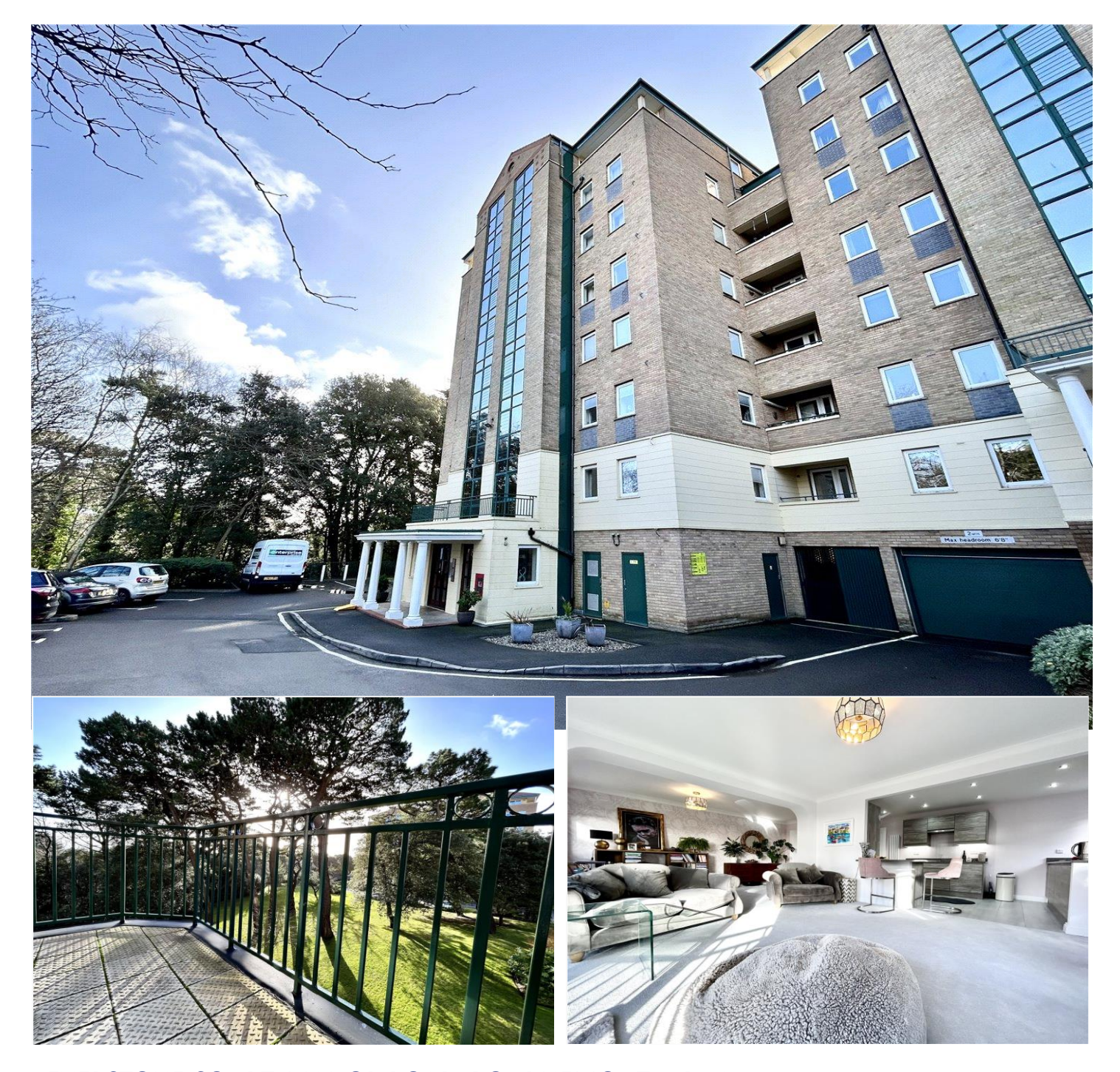
KEVERSTONE COURT, MANOR ROAD, BOURNEMOUTH, BH1