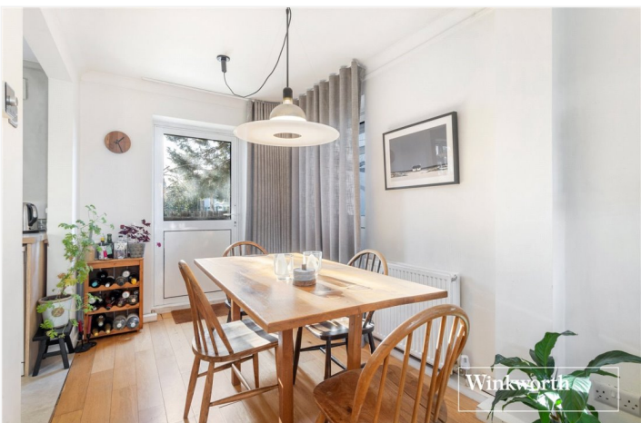
ST. MICHAEL'S CLOSE, FINCHLEY, LONDON, N3 £390,000 LEASEHOLD