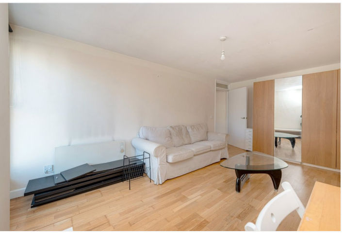
HARROW ROAD, W9 OFFERS OVER £350,000 LEASEHOLD