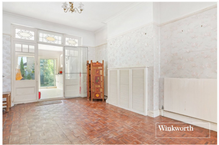
WOODBERRY GARDENS, NORTH FINCHLEY, LONDON, N12 £820,000 FREEHOLD