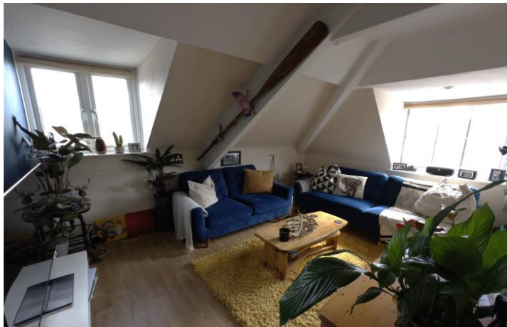
CLARENCE STREET, DEVON, TQ6 £190,000 LEASEHOLD