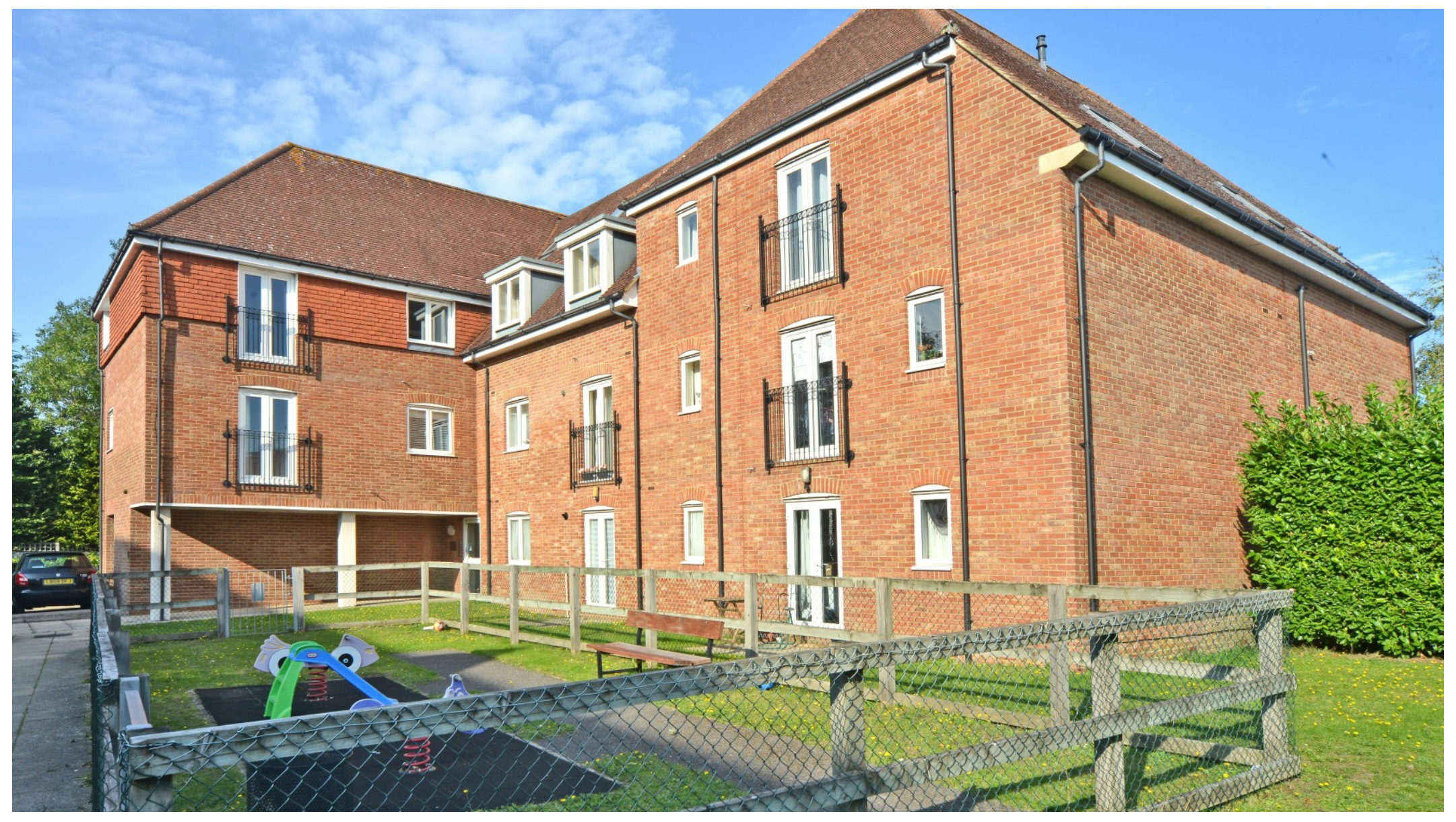
Under the Consumer Protection Regulations 2008, these Particulars are a guide and act as information only. All details are given in good faith and are believed to be correct at time of printing. Winkworth give no representation as to their accuracy and potential purchasers or tenants must satisfy themselves by inspection or otherwise as to their correctness. No employee of Winkworth has authority to make or give any representation or warranty in relation to this property.