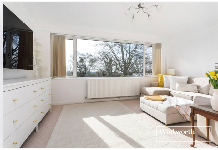
SANDERS LANE, MILL HILL EAST, LONDON, NW7 OFFERS IN EXCESS OF £350,000 LEASEHOLD