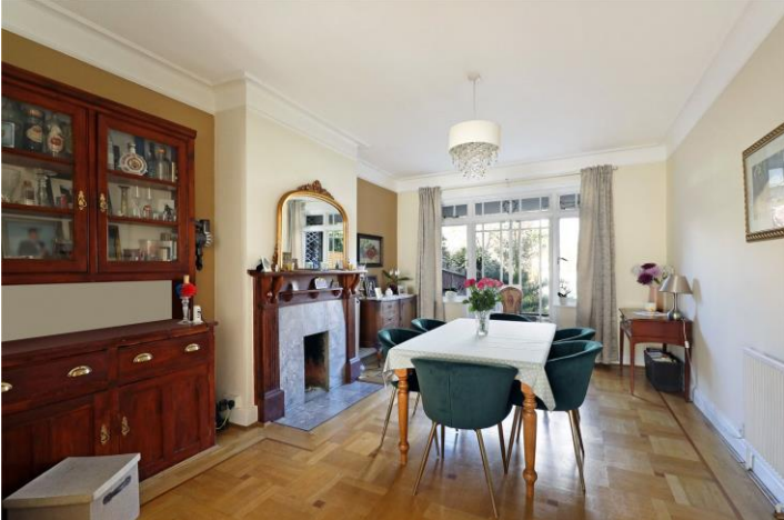
GUNNERSBURY AVENUE, LONDON, W5