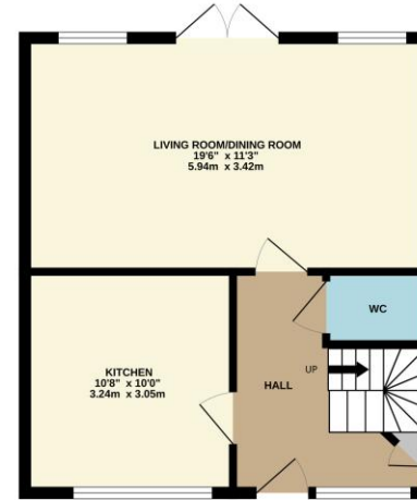
GROUND FLOOR 426 sq.ft. (39.6 sq.m.) approx.