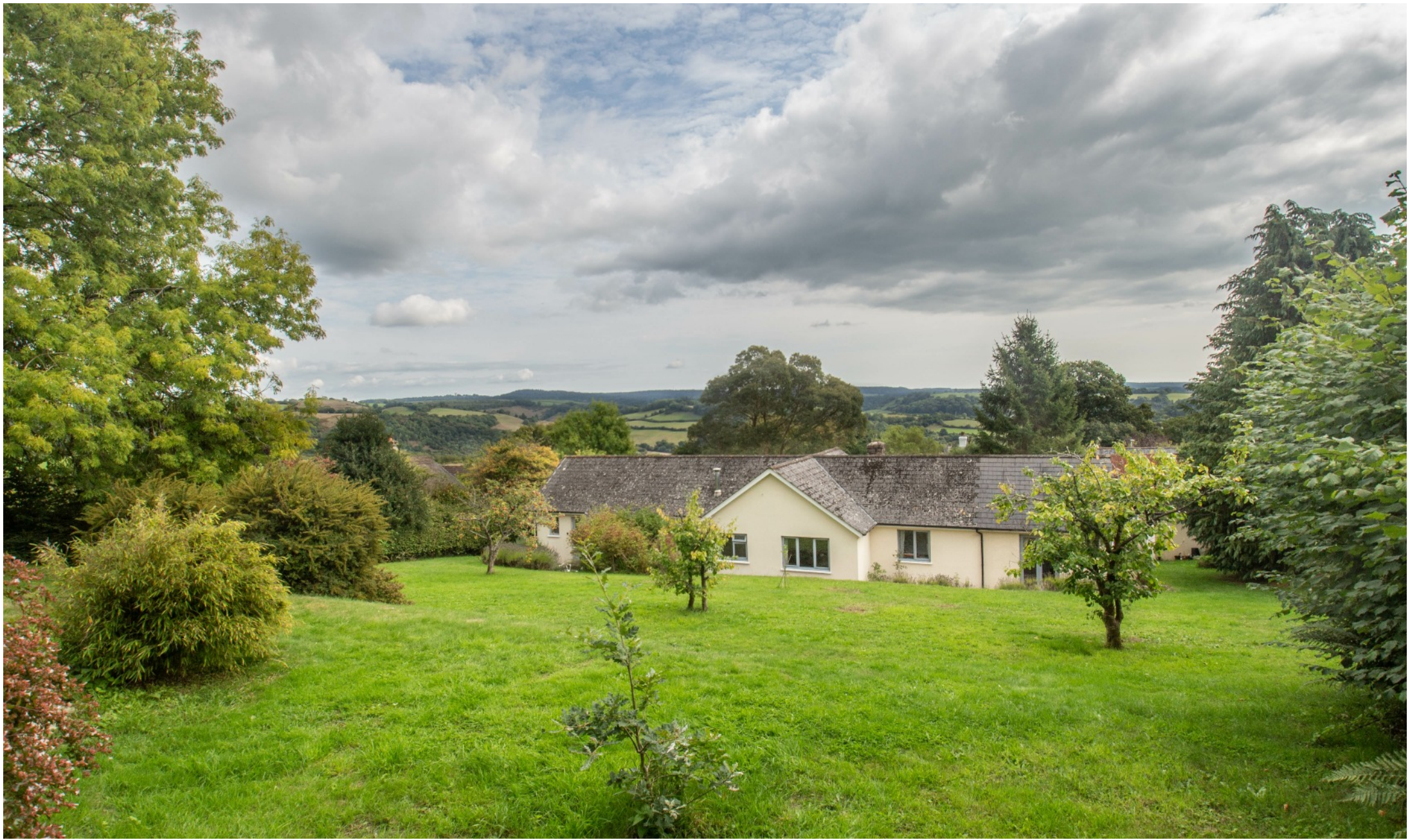
PALE RISE, CHRISTOW, EX6 7PF