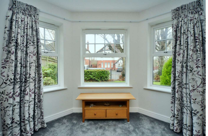
POTTERS COURT, 2A ROSEBERY ROAD, CHEAM, SUTTON, SM1 £365,000 LEASEHOLD

A BEAUTIFULLY PRESENTED TWO BEDROOM, TWO BATHROOM, GROUND FLOOR APARTMENT SET WITHIN THE SOUGHT AFTER LANDSEER CONVERSATION AREA