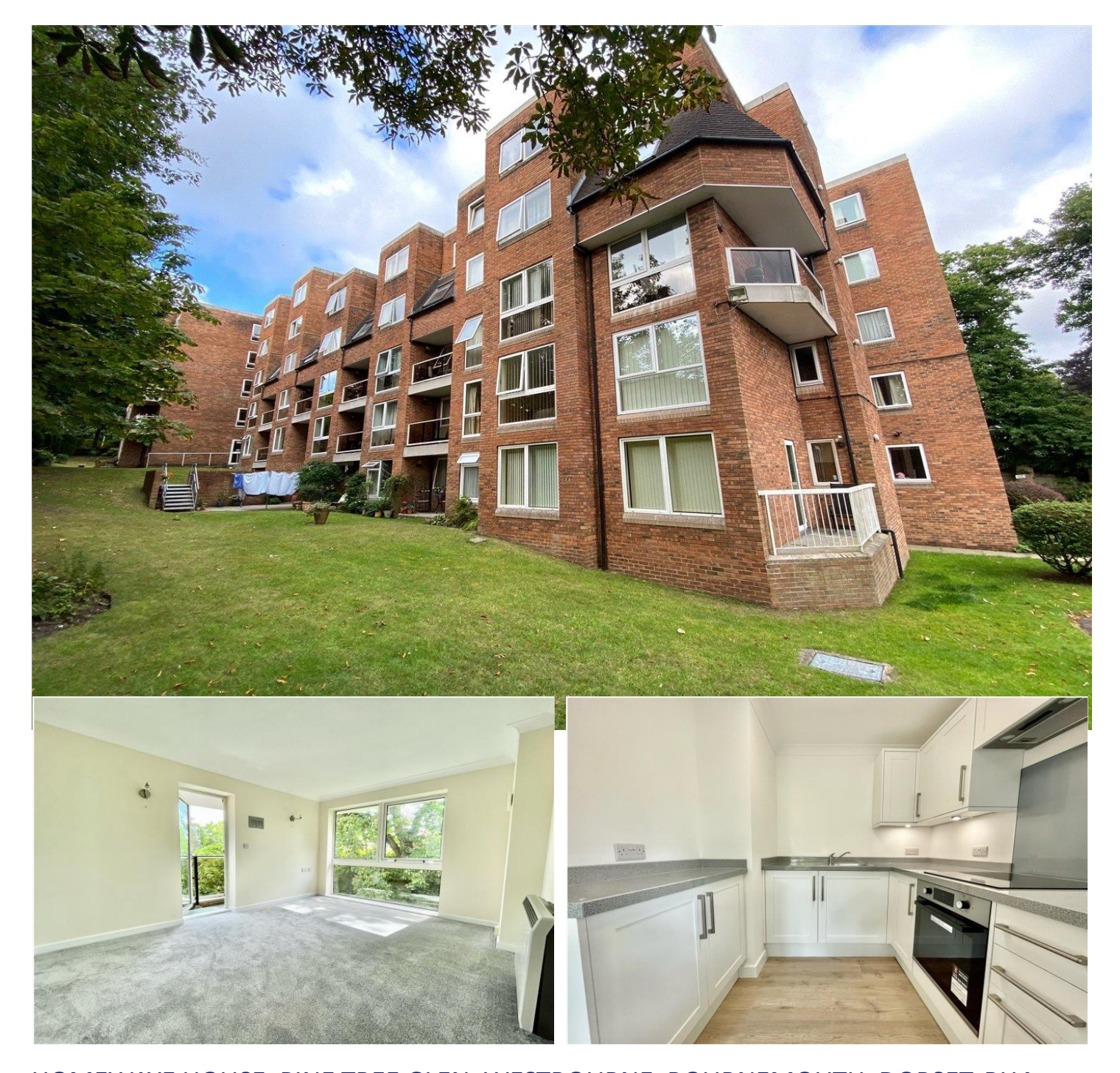
HOMEWAYE HOUSE, PINE TREE GLEN, WESTBOURNE, BOURNEMOUTH, DORSET, BH4