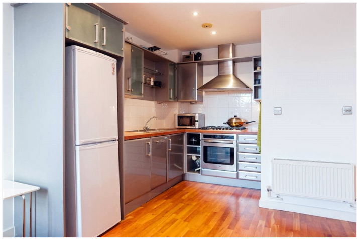
ANLABY HOUSE, LONDON, E2 £595 PER WEEK FURNISHED