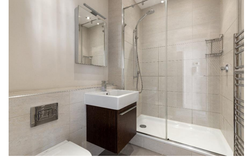
First Floor Flat | Large west facing Terrace | Share of Freehold