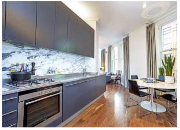
Exide House, Shaftesbury Avenue, London, WC2H 8EL