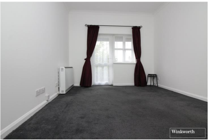
THE PINES, BOREHAMWOOD, HERTFORDSHIRE, WD6 £1,300 PER MONTH UNFURNISHED

A ONE BEDROOM FIRST FLOOR PURPOSE BUILT FLAT LOCATED ON ANTHONY ROAD COMPRISES OF ONE BEDROOM, RECEPTION ROOM,