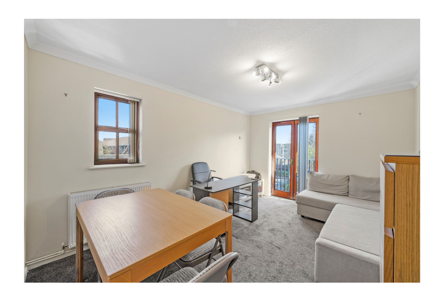
\ \, \textbf{A view from reception room} \\