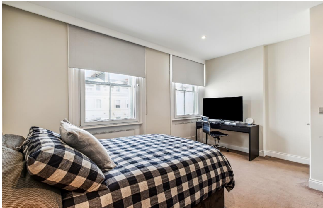
Share of Freehold | Two Double Bedrooms | Communal Gardens