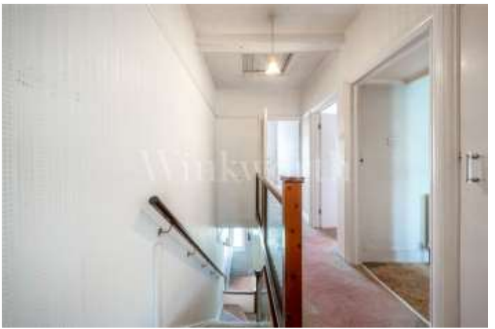
CREWYS ROAD, NW2 £799,950 FREEHOLD