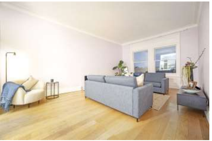
RIDGMOUNT GARDENS, LONDON, WC1E £1,200,000 LEASEHOLD

A CHARMING TWO BEDROOM APARTMENT ON THE TOP FLOOR OF ONE OF BLOOMSBURY'S MOST IMPRESSIVE LATE VICTORIAN PORTERED MANSION BUILDINGS.