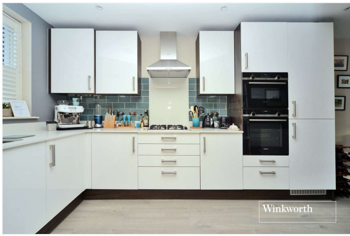
POTTERS GROVE, NEW MALDEN, KT3 £725,000 FREEHOLD

A MODERN, THREE BEDROOM FAMILY HOME LOCATED CLOSE TO GOOD SCHOOLS AND TRAINS INTO LONDON