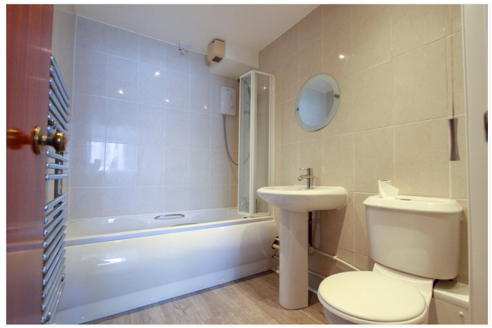
QUEEN ANNES DRIVE, WESTCLIFF ON SEA £169,995 SHARE OF FREEHOLD