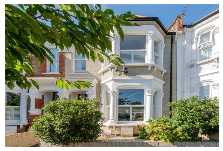
LINDEN AVENUE, LONDON, NW10 £1,850,000 FREEHOLD

A SUPERB FOUR BEDROOM FAMILY HOME IN A GREAT LOCATION CLOSE TO CHAMBERLAYNE ROAD AND QUEENS PARK WITH A LOVELY WEST FACING PRIVATE GARDEN.