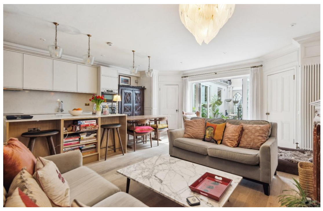
Excellent Condition | Three Double Bedrooms | Communal Gardens | Private Patio