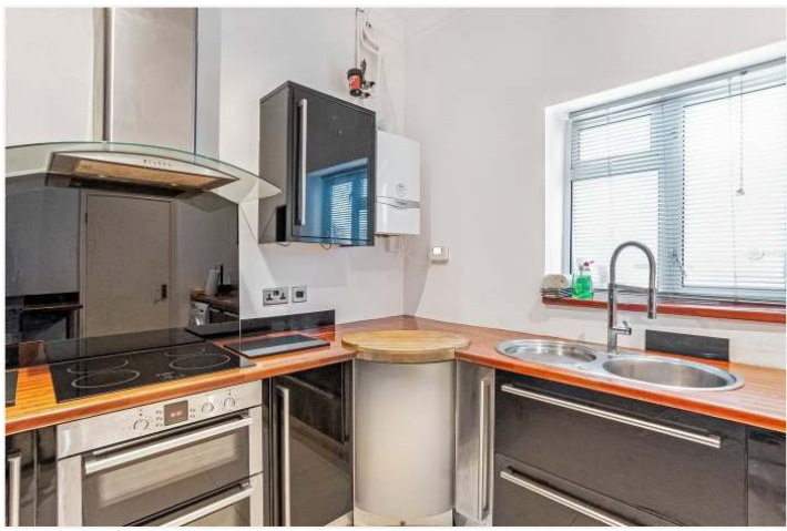
ELSIE ROAD, EAST DULWICH, LONDON, SE22 OIEO £1,800,000 FREEHOLD