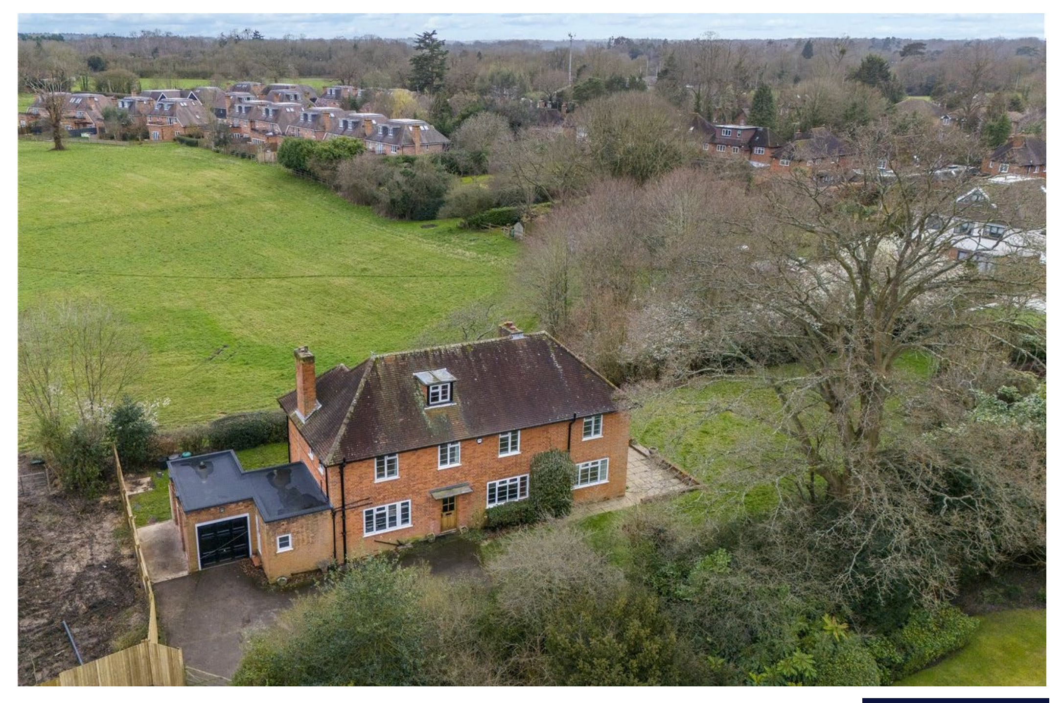
18 BURNHAM AVENUE, BEACONSFIELD, BUCKINGHAMSHIRE, HP9 2JA