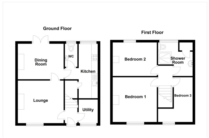
This floorplan is for illustration purposes only and is not to scale. The position and size of doors, windows, appliances and other features are approximate.