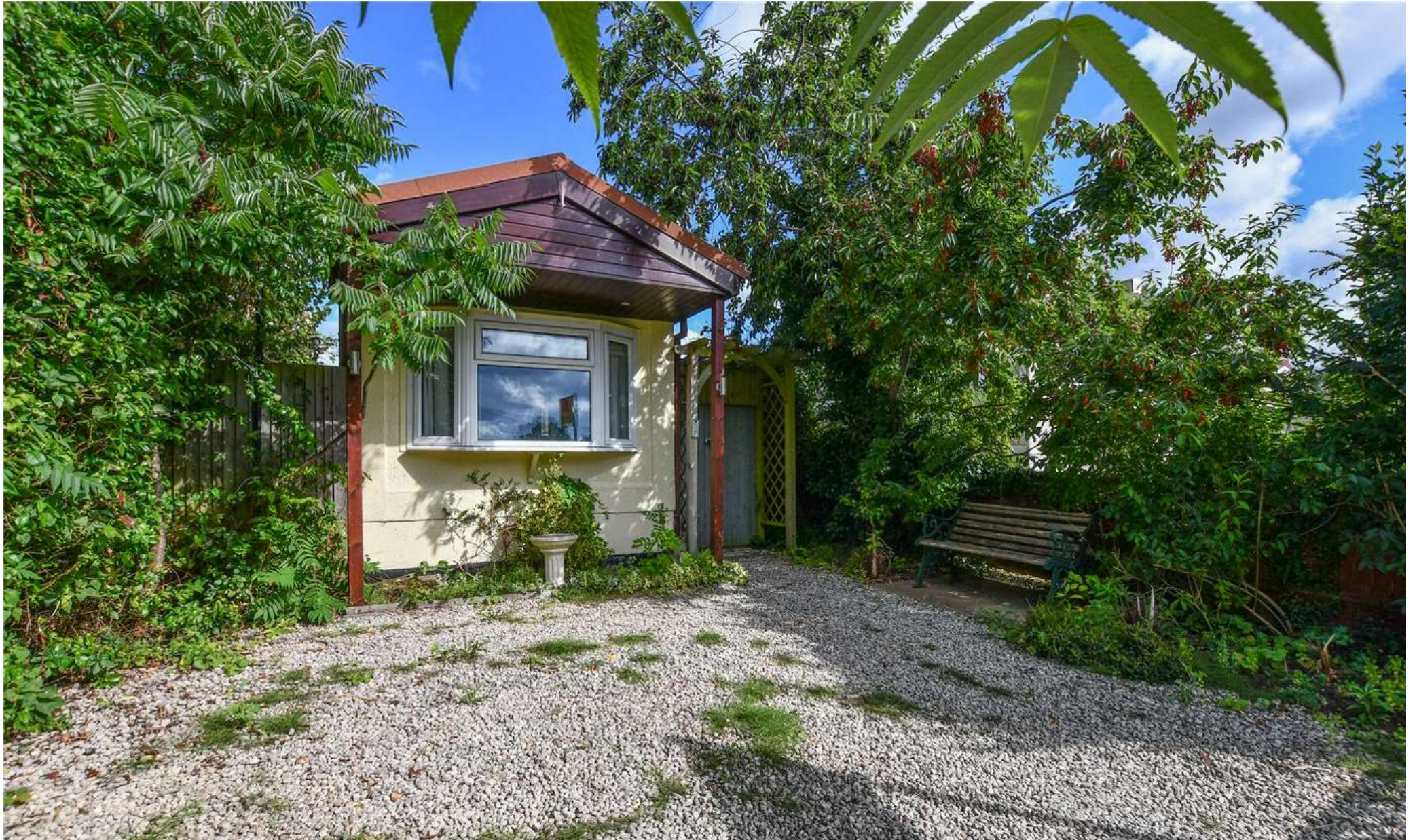
5 GROVELANDS PARK, WINNERSH, WOKINGHAM, BERKSHIRE, RG41 5LD £140,000