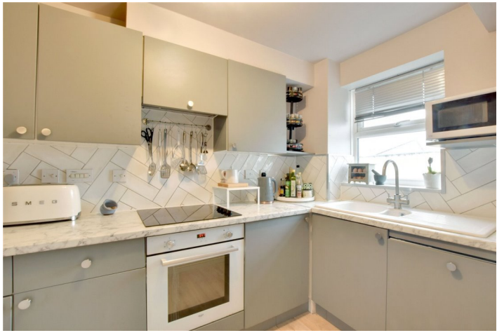
CORBIDGE COURT, DEPTFORD, LONDON, SE8 £365,000 SHARE OF FREEHOLD

WE ARE DELIGHTED TO OFFER THIS SUPERB ONE BEDROOM SECOND FLOOR APARTMENT, THAT MEASURES CIRCA 447 SQ FT, COMES WITH A PARKING SPACE AND IS PART OF THE MILLENNIUM QUAY RIVERSIDE DEVELOPMENT BORDERING ONTO WEST GREENWICH.