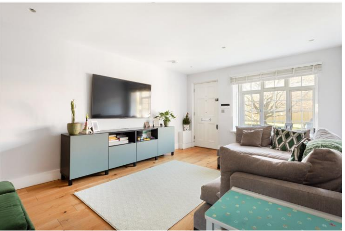
COLLEGE GARDENS, SW17 £800,000 FREEHOLD