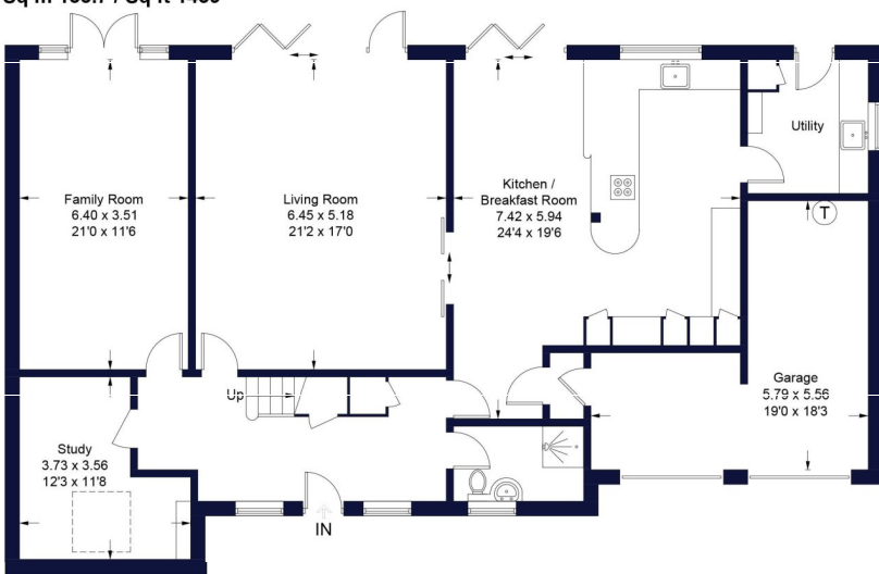
Ground Floor Sq m 161.9 / Sq ft 1743

Illustration for identification purposes only, measurements are approximate, not to scale. FloorplansUsketch.com © 2023 (ID1026729)