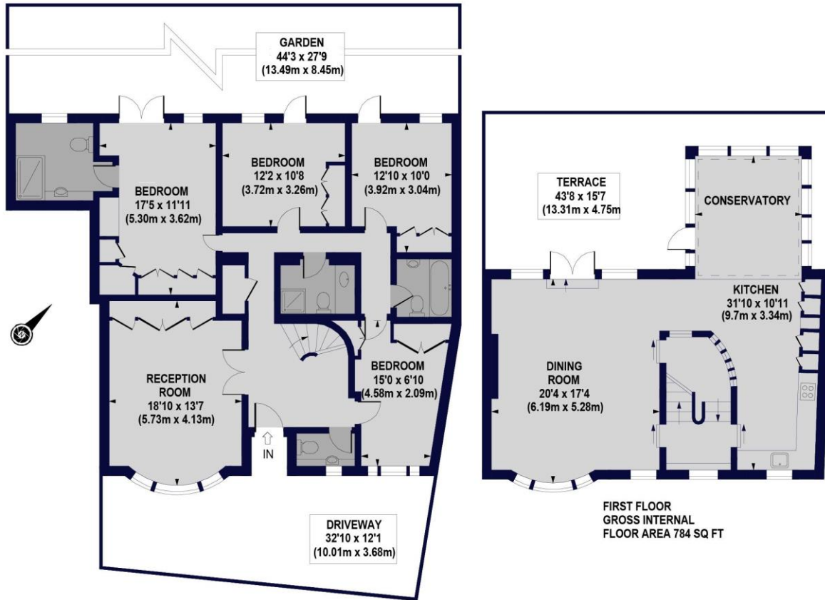
GROUND FLOOR GROSS INTERNAL FLOOR AREA 1268 SQ FT