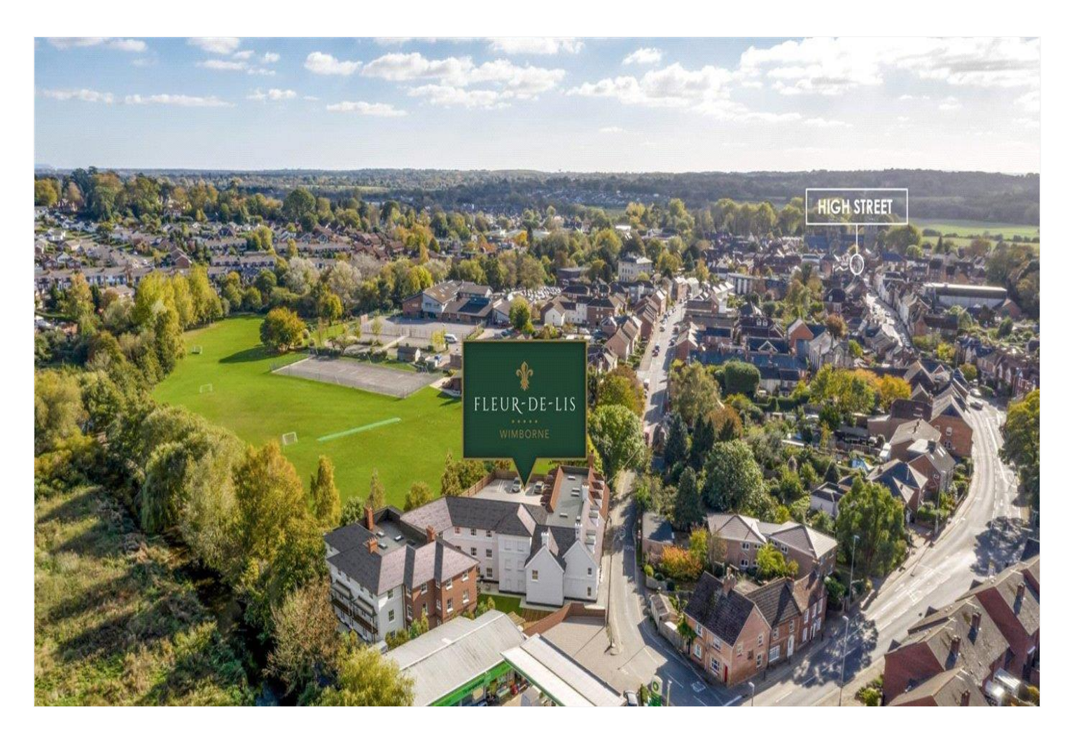
FLAT 13, FLEUR DE LIS, 68 EAST BOROUGH, WIMBORNE, DORSET, BH21 1PL £250,000 LEASEHOLD