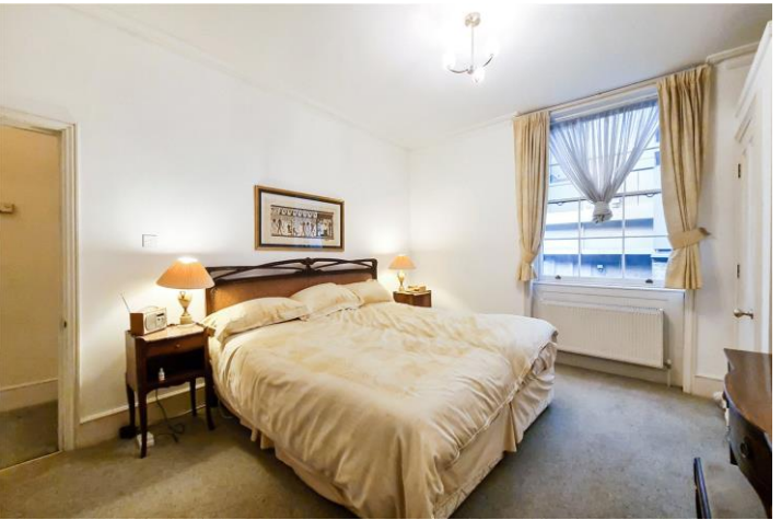
CRAVEN STREET, LONDON, WC2N £775,000 LEASEHOLD

A CHARMING ONE BEDROOM, SECOND FLOOR APARTMENT SET IN AN IMPRESSIVE GRADE II MID GEORGIAN TOWNHOUSE.