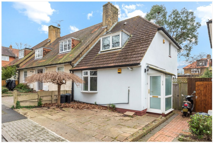
PUTNEY PARK LANE, SW15 £2,250 PER MONTH FURNISHED