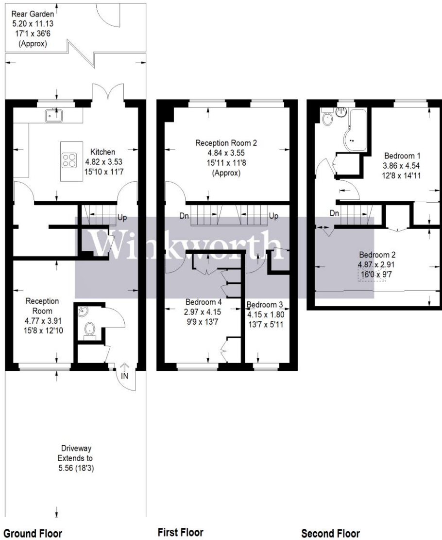
Illustration for identification purposes only, measurements are approximate, not to scale. Winkworth © 2023 (ID963643)

Approximate Gross Internal Area 128.4 sq m / 1382 sq ft