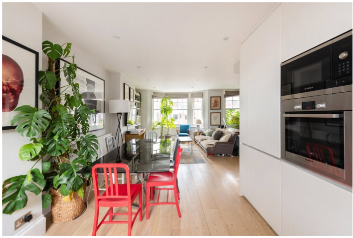
KESLAKE ROAD, LONDON, NW6 £850,000 LEASEHOLD